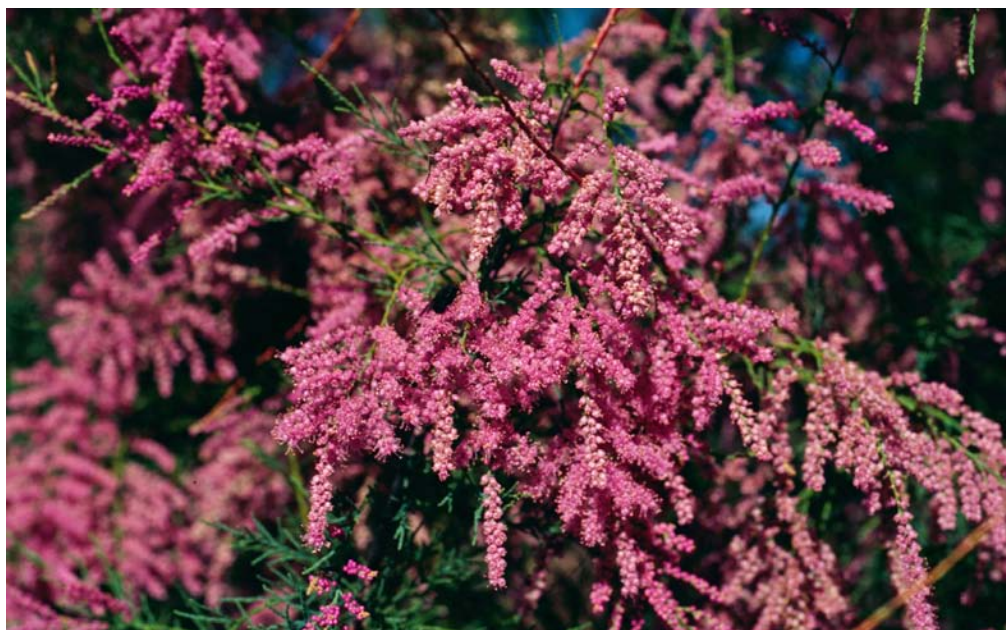
ABOVE: Saltcedar foliage

Several species of Tamarix (including T. ramosissima , T. pentandra , T. chinensis , T. parviflora ) were introduced to North America. Species identification is difficult because some of the species are very similar in appearance and hybridization is common. 3